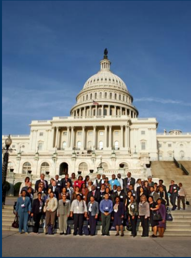
AAAED Members in front of the U.S. Capitol

Looking for an organization where you can find professional development and training, network with members of your profession and have your views known to policymakers?